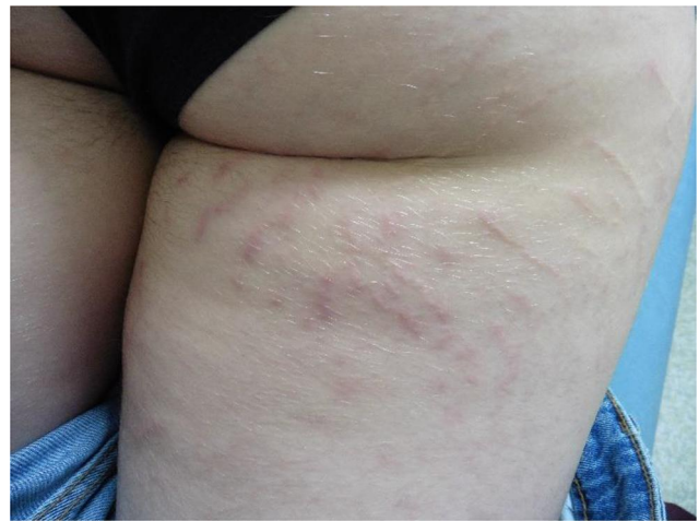
Figure 4 Severe striae distensae in a 16-year-old girl with psoriasis. The patient received treatment with topical steroids for a long time.

Emollients are an essential part of the long-term care of patients with psoriasis. As in atopic dermatitis, emollient treatment of the areas usually affected by psoriasis reduces the frequency of relapse. In addition, by reducing pruritus, emollients limit the risk of scratching and the Koebner phenomenon on dry skin. 61 The choice of emollient should be made with the adolescent, after discussions to determine the most appropriate product (with or without urea, not too oily, with a pleasant fragrance, etc.).