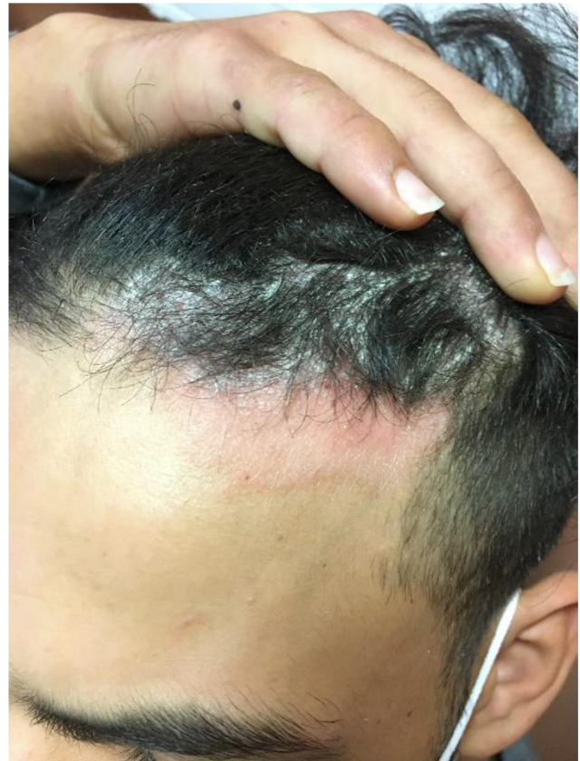
Figure 2 Scalp psoriasis in a 16-year-old boy. This adolescent was suspected of having tinea capitis.

Nails are affected in more than one-third of adolescents with psoriasis, mainly with pitting of the fingernails, and onycholysis and pachyonychia of the toenails. Nail involvement has been associated with an increase in the overall severity of psoriasis and psoriatic arthritis. 26 However, although there is a suspected link between nail psoriasis and psoriatic arthritis in adults, the predictive value of nail