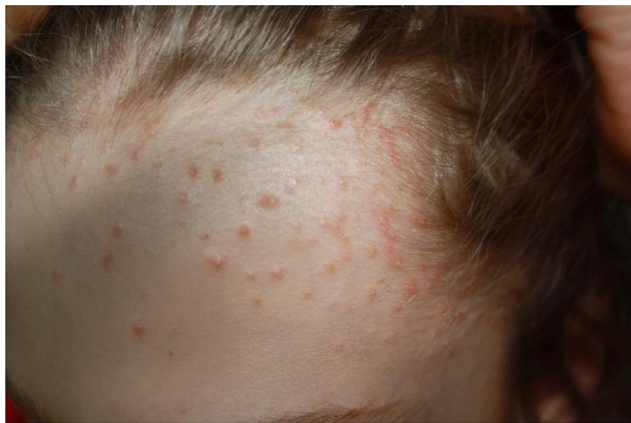
Figure 3 Clobetasol propionate shampoo-induced acne in a 14-year-old girl with scalp psoriasis.

There are no major concerns specifically linked to the use of topical treatments in adolescents, except those concerning topical steroids described in Specific Physical Conditions of Adolescence and Psoriasis Treatments.