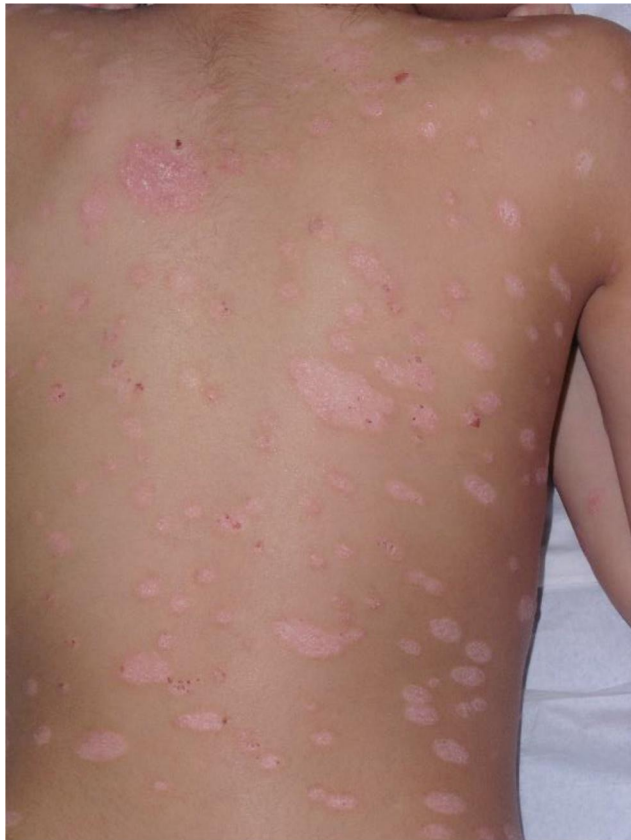
Figure 1 Plaque psoriasis in a 13-year-old boy.

The scalp is often the only location affected by psoriasis in adolescents, leading to misdiagnosis as simple dandruff or tinea capitis. 24 The hairline (Figure 2) and occipital scalp are often the first sites to develop the typical plaque form. Some severe forms can have a pityriasis amiantacea presentation, with thick, fixed, silver scales. In mild forms, scalp psoriasis resembles seborrheic dermatitis. Scalp psoriasis has been associated with an increase in the severity of psoriasis and with the Koebner phenomenon, suggesting a possible role for trauma or scratching in the aggravation of scalp psoriasis. 25 In adults, scalp psoriasis is associated with psoriatic arthritis but there are no data confirming such an association in children or adolescents.