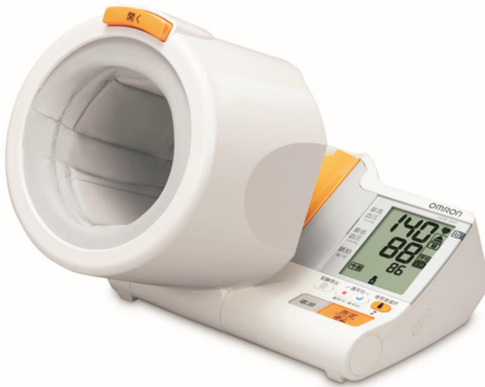
Figure 1 Omron HEM-1040 blood pressure measuring device.

For each experiment, the manufacturer provided standard production device models. The validation team for each device consisted of three observers who were experienced in measuring BP and trained under the online program of the British and Irish Hypertension Society ( https://bihsoc.org/resources/bp-measurement/bp-measurement-ausculta )