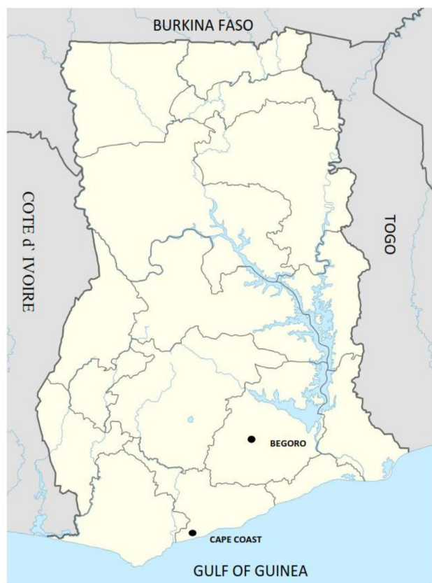
Figure 1 The map of Ghana showing the two study sites (black dot) within different ecological zones: Begoro in the forest area and Cape Coast in the coastal savanna area.

The antimalarial drugs used in this study included chloroquine (CQ), amodiaquine (AMD), artesunate (ART), mefloquine (MFQ) and dihydroartemisinin (DHA). These drugs were