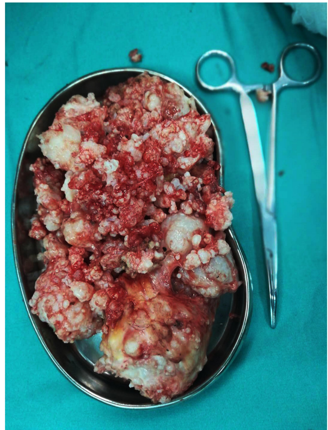
Figure 4 Multiple cartilaginous loose bodies found in the joint cavity excised and sent for biopsy.