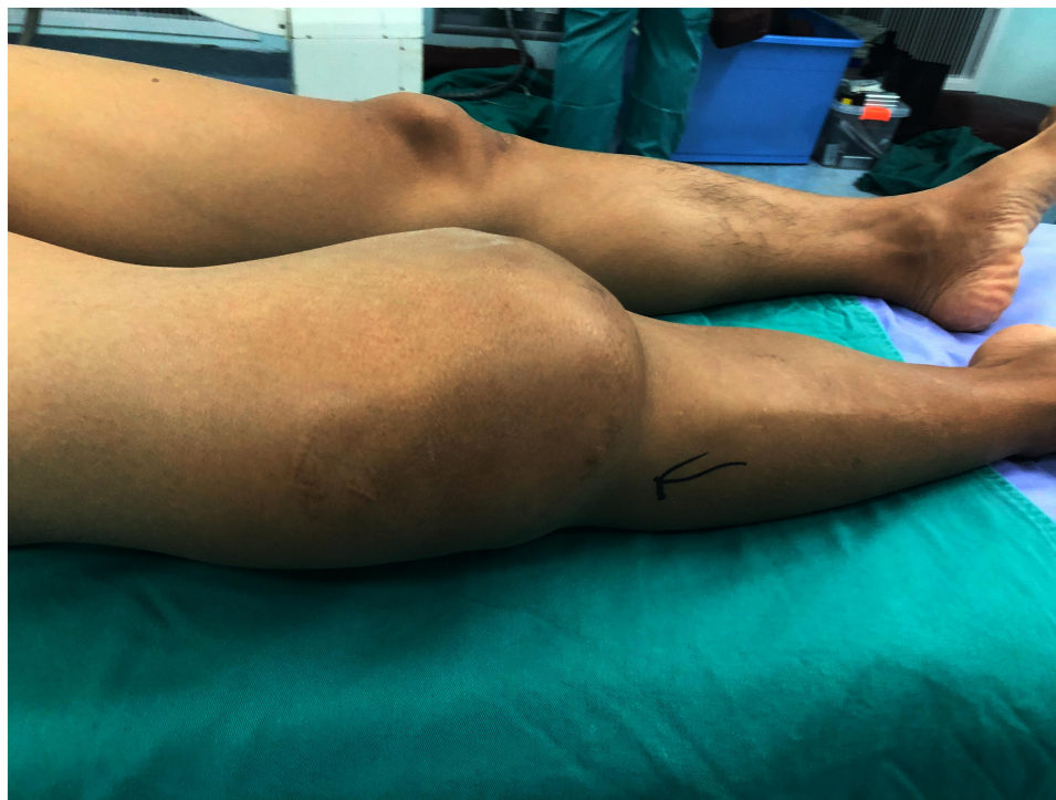
Figure 1 Pre-operative photograph of the swelling over the right knee.

The patient was treated surgically, with excision of the mass. The incision was about 15 cm in length and was exposed layer to layer showing the ankylosis and obvious swelling of the knee region. After exposure bony lesions were found to be adhered to the soft tissues in cluster form with unclear boundaries and local infiltration internally. [Figure 3] The multi osteocartilaginous nodules anterior to the femur were excised in blocks while the patella which was engulfed and eroded by the lesion was scrapped, repaired, and was protected. In the posterior region, few lesions were entangled with blood vessels and nerves so it was not excised completely. As complete excision of the tumor lesions was not possible there is a high chance of recurrence and it was informed to the family members. The knee replacement is not feasible in his case therefore patient was counseled for it might eventually lead to amputation. The resected mass was sent for histopathological examination. [Figure 4] Microscopic examination in Hematoxylin Eosin staining was done and was observed in 40x, 100x, 200x, 400x magnifications. [Figure 5A–D] The result of the