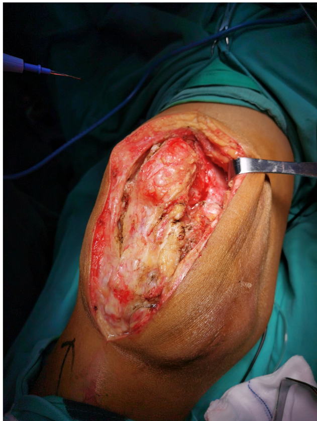
Figure 3 Intra-operative (anterior approach) photograph showing the nature of the synovial osteochondromatosis.