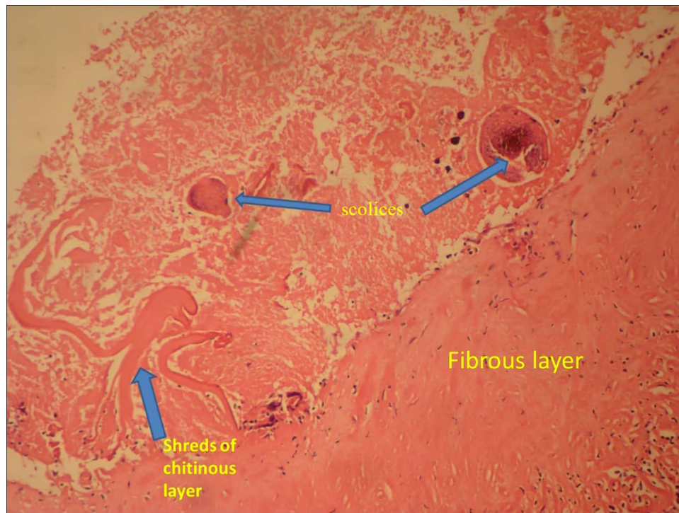
Figure 3 Histopathological specimen confirmed the hydatid cysts. The fibrous layer was named directly. Arrows showed shreds of the intermediate lamellar chitinous layer and the scolices in the inner layer.

Our patient was admitted to the inpatient department due to pain and a rapidly enlarging mass in the abdomen left upper quadrant area. Abdominal US and CT scan findings in the patient showed cyst wall calcification, daughter cysts, and membrane detachment, which is characteristic of HC findings. 12 The size of isolated giant splenic HC was more than 20 cm in previous articles such as Pukar et al and Sarkari et al, which were similar to our report. 4,12 Parasite-Human Immunologic relationships and the enveloping defensive structure around cysts are the main contributors to the growth of a HC.