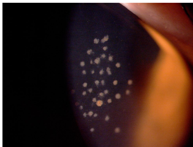
Figure 1 Presence of medium-sized keratic precipitates in a young girl with JIA-uveitis.

We conducted a retrospective study of all uveitis patients seen at the Center of Specialized Care in Lausanne between 2000 and 2020, identifying granulomatous signs at presentation or during follow-up in patients with JIA-uveitis. All patients referred to or directly seen at our center with the diagnosis of JIA-uveitis who had positive and elevated ANA titers ( > 1/160 ) were included in this study. Exclusion criteria were a positive Mantoux test or a positive Tuberculosis IGRA test (interferon gamma test), elevated serum lysozyme,