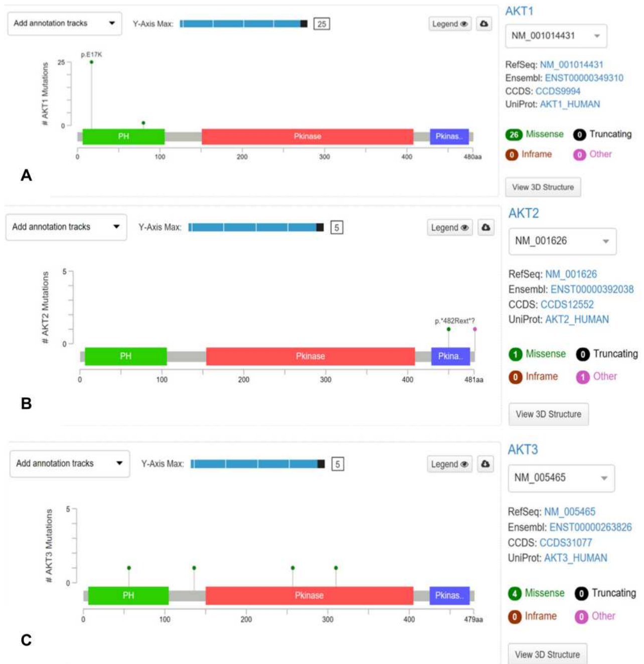
Figure 3 Diagram of domains of (A) AKT1, (B) AKT2 and (C) AKT3 with mutations identified in the GDPH cohort. Abbreviation: PH, pleckstrin homology.

Chinese population were missense mutations, among which 80.6% were detected in the major hotspots concentrated in the helical region (E17K). Conversely, AKT1-E17K mutation was absent in patients of the TCGA cohort. This unique high-frequency mutation in the Chinese population suggests that it could serve as a risk factor for breast cancer in the Asian population. The E17K mutation is located near the specific binding