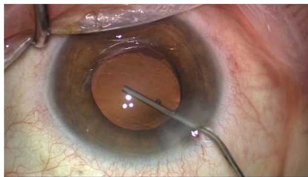
Figure 1 Toric IOL being aligned after implantation.

Descemetorhexis was then performed under cohesive OVD in the anterior chamber and a dilated pupil with the red reflex helping visualization of the membrane tear. The size of Descemet removal was 0.25mm larger than the intended DMEK graft. Two sideports were created to facilitate graft maneuvering during unfolding. Acetylcholine 10mg/mL was injected in the anterior chamber to promote miosis and OVD was completely removed using the I/A handpiece. The donor Descemet roll was stained with 0.1% trypan blue and inserted in the anterior chamber using a glass cartridge (Geuder, Germany). After the tissue was injected, it was completely opened and centralized in the cornea with the proper orientation verified by the asymmetric “F”-stamp. After that, a complete air fill was used to fixate the graft in place with intraocular