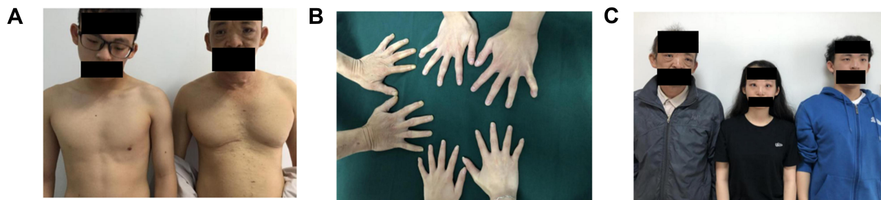
Figure 1 (A) Preoperative facial and chest signs of Case 1 and Case 3. (B) Hand deformity of Case 1, Case 2, Case 3. Upper: the father; below: the sister; left: the brother. (C) Facial characteristics of Case 1, Case 2 (postoperative) and Case 3.

Physical examination: temperature (T): 36.5°C; pulse (P): 68 beats/minute; respiration (R): 20 breaths/minute; blood pressure (BP): 108/67 mmHg. The shape of the head was normal, the distance between the eyes was increased, single eyelid epicanthus (Figure 1A and C). No abnormality was found in the heart and lungs, the aperture of the thorax had no malformation, and bilateral nipple areolas were absent (Figure 2A). No gland tissue was palpated. Bilateral axillary hair was sparse, and no axillary web was found (Figure 2B). The fingers of both hands were short, the distal phalanx of the little fingers presented with slight flexion and deformity, and both hands were webbed (Figure 1B). Chest magnetic resonance imaging (MRI): bilateral greater and lesser pectoral muscles were normal, and no malformation was found in the ribs. Breast color Doppler ultrasound: no glandular echo was found in the subcutaneous space of the bilateral