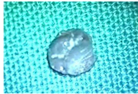
Figure 2 Handmade gunshot with flat and sharp edges.

PVR underwent fluid-air exchange and aspiration of the subretinal fluid through the break. Any residual epiretinal or subretinal membranes were removed followed by injection of 5000 cSt silicone oil. Silicone oil was removed from all cases after minimum period of 6 months.