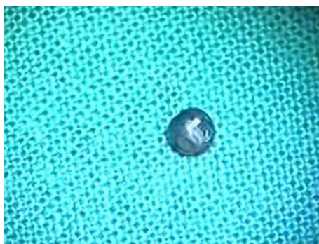
Figure 1 Factory-made gunshot (rounded ball 4.5–5mm with faceted edges).