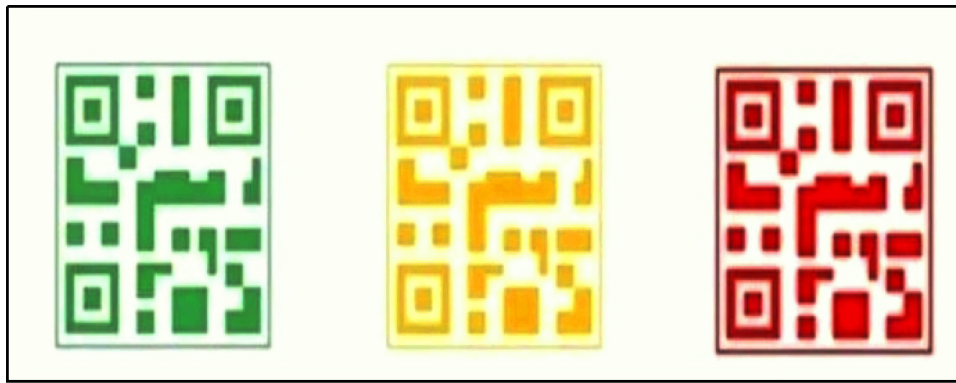
Figure 2 Sample of travel health code of China Mainland.

The travel health code is divided into three colors: green, red, and yellow. Green indicates that the citizen and their cohabiting family members recently have had a normal body temperature, no hospital records of treatment of respiratory diseases, and have not visited areas with a COVID-19 high-risk level. Yellow indicates that the citizen has recently visited some risky areas or places with positive cases of COVID-19; has had a certain degree of contact history with people infected with COVID-19; or the citizen has recently experienced some respiratory-related diseases. Red is the highest alert level, indicating that the citizen comes from the epidemic-center area, or has experienced symptoms such as fever in the last 14 days. It can also indicate that a citizen and their family have been identified as close contacts of COVID-19 patients and needed to isolate and be observed. According to the color of the health code, the transportation department has the right to accept or reject passengers. Passengers whose travel health code is red or yellow are usually rejected, while passengers whose travel health code is green are allowed to travel. 24