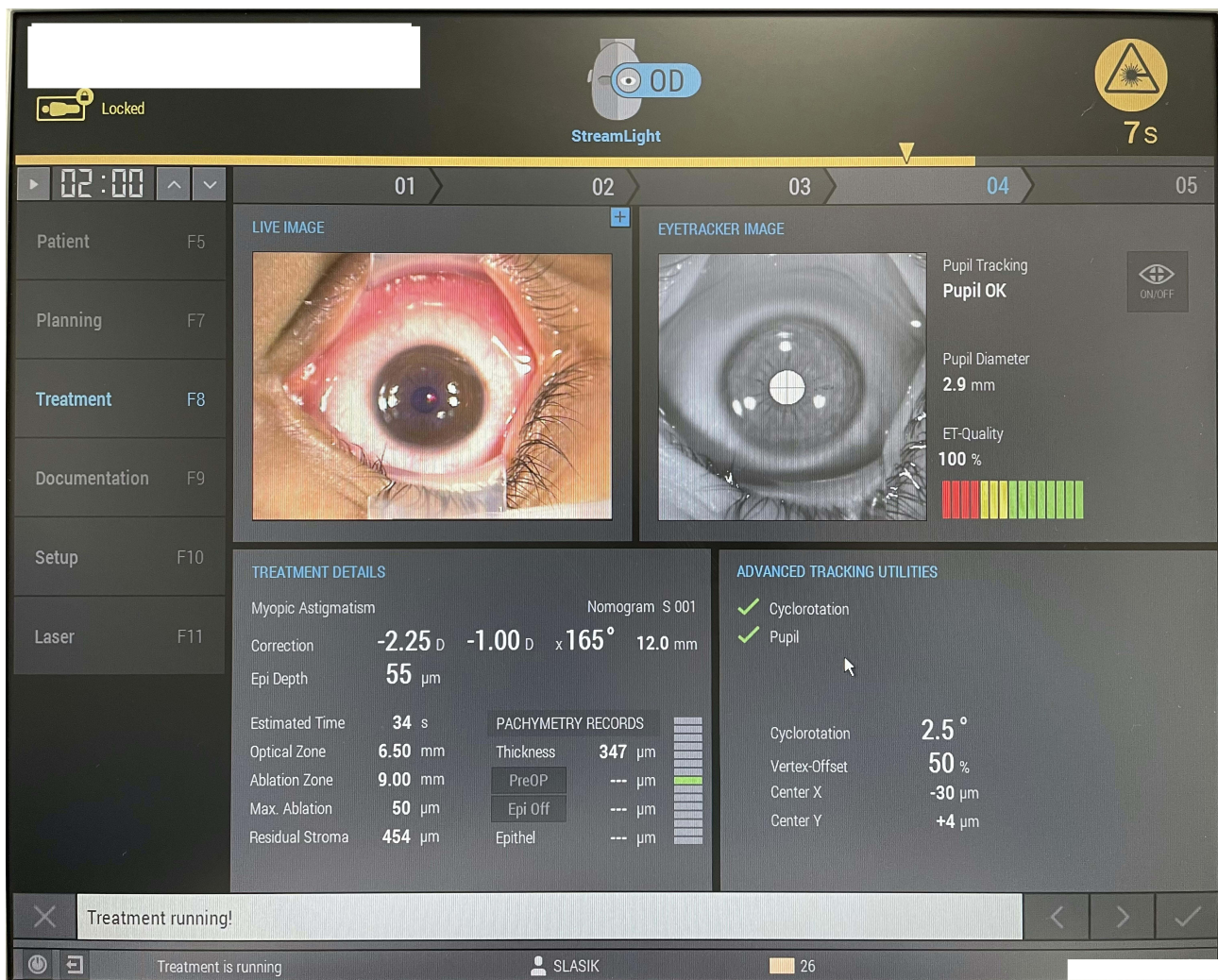
Figure 1 The SL platform computer display, showing the yellow bar denoting the end of epithelial ablation (yellow arrowhead) and beginning of stromal ablation.

0.02% Mitomycin C (MMC) was used when the calculated ablation depth was more than 60\mu and was applied for 20 seconds.