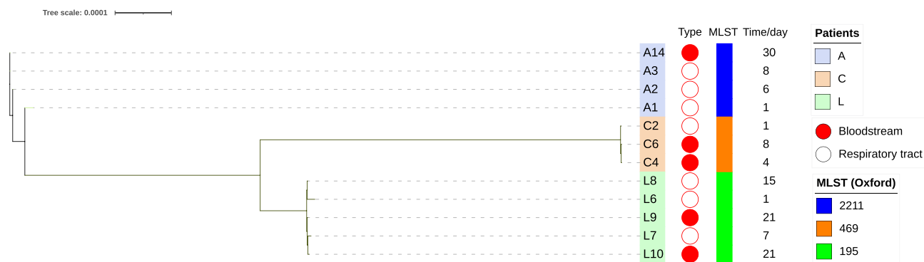
Figure 1 Phylogenetic analysis of A. baumannii collected from respiratory tract carriage to bloodstream infection in three patients. The phylogenetic tree was constructed based on core single nucleotide variants. The scale bar represented the number of nucleotide substitutions per sites. The colour of the outer of the trees denoted different patient. The red circle denoted isolates from bloodstream and the white circle denoted isolates from respiratory tract. The sampling time interval was listed on the right, and the first isolate in each patient was set day 1.

(Table S2). A complete list of all the genic mutations differing between the isolates was given in Table 1. Except for a hypothetical protein, the SNVs were found in srpA , gspJ , srmB , fimV , scal , transposase , pilR , pcaJ , tniA genes, which encode for organic peroxide-dependent peroxidase, general secretion pathway protein, DEAD box helicase family, Tfp pilus assembly protein FimV, phage-related minor tail protein, transposase IS66 family, sigma-54 interaction domain protein, 3-oxoadipate CoA-transferase, and mu transposase, respectively. Two genes encode the same protein, Tfp pilus assembly protein FimV. The genes encoding for 3-oxoadipate CoA-transferase PcaJ and Tfp pilus assembly protein FimV had the highest density of SNVs. Two missense variants (Ile91Leu, Phe90Leu) and one synonymous variant (Arg89Arg) were detected in PcaJ. One missense variant (Thr4Lys) and two synonymous variants (Asp5Asp and Asp18Asp) were detected in FimV.