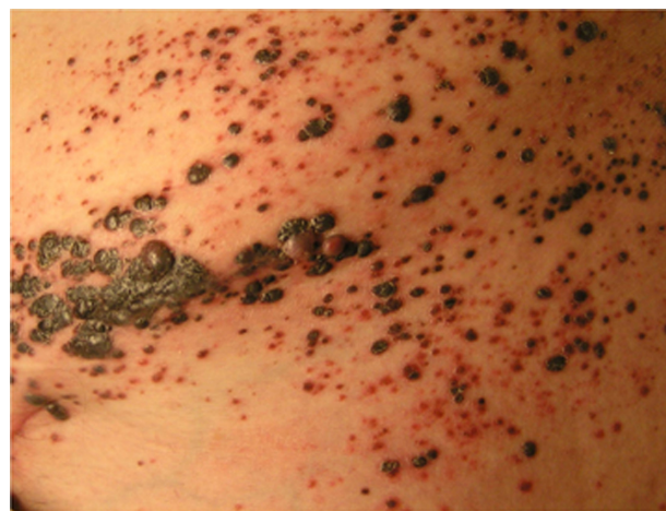
Figure 1 Unresectable melanoma in-transit metastases.

Localized administration of immune modulating agents has been shown to lead to regression of cutaneous melanoma metastases in several phase II studies. In one study, intralesional interleukin-2 given 2–3 times weekly was tested in 24 patients with one or more soft tissue or cutaneous melanoma metastases yielding complete responses in 65%