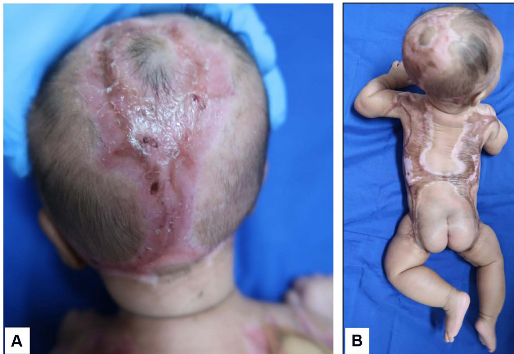
Figure 3 Complete epithelialization on day 72, on scalp ( A ) and trunk ( B ).

on extremities or widespread on extremities and torso accompanied by epidermolysis bullosa (EB); type VII is ACC on extremities without EB; type VIII is ACC associated with teratogens or varicella and herpes simplex infections, can affect scalp locally or any other areas; type IX is ACC associated with malformation syndromes. 5,7