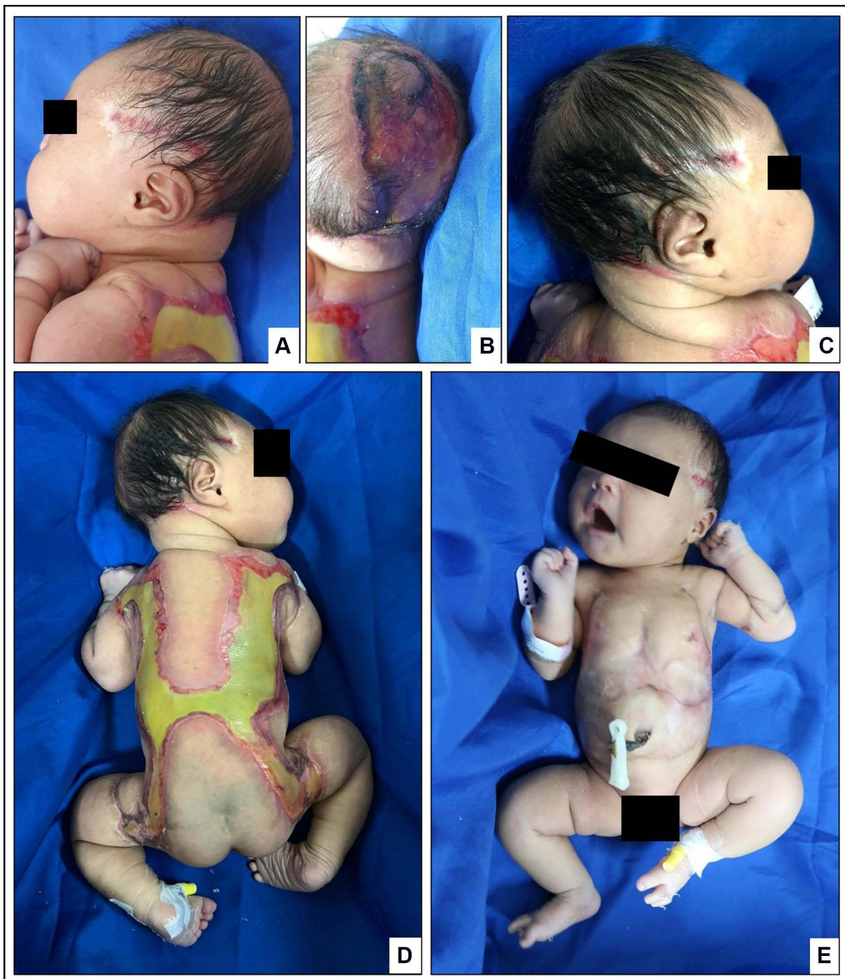
Figure 1 Clinical manifestation of ACC, absence of the skin on scalp (A–C), back, buttocks, and upper limbs (D) with an atrophic scar on the chest and abdomen (E).

In 1986, Frieden classified ACC into nine types, based on the location, pattern of skin disorders, inheritance, associated malformations, teratogens, and involved syndromes. 5,7,8 Some types of ACC were inherited in an autosomal dominant or recessive manner. 8 Type I ACC, the most common type, is localized on the scalp with no other associated anomalies. Type II is scalp involvement associated with limb