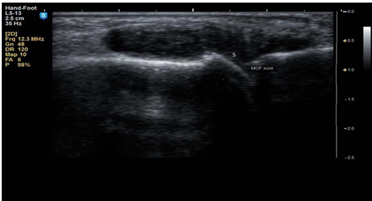
Figure 2 Gray-scale US long-axis view of MCP joint of right index finger of the same patient showing synovitis grade 3 (synovial hypertrophy and effusion).

Abbreviations: R, radius bone; L, lunate bone; C, capitate bone; S, synovitis.