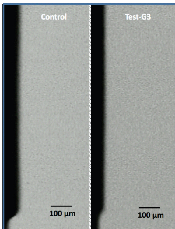
Figure 4 Example microradiographs of enamel initially eroded (left – Control) and after treatment with treatment regime G3 for four weeks (right – Test).

going to bed. Subjects were instructed to neither rinse their mouth nor take any drink for at least 30 minutes after rinsing. Also included in the instructions was to record the number and time of toothbrushing each day in the diary provided; refrain from the use of any other oral hygiene products for the duration of the trial; maintain their normal dietary habits; and return the remaining toothpaste and mouthrinse after each study phase. The weight of toothpaste and mouthrinse were measured before and after the study phase. This was done to monitor compliance, ensure that the subjects discontinue the use of the previous product, and ensure uniformity in the use of the oral hygiene product, which may otherwise unduly influence the de-/remineralization cycle during the study periods. After each 28-day period, the appliance was detached, and after the washout period the next appliance was cemented in place on the same tooth as the first appliance. This procedure was repeated until the three phases were completed by each subject. At the detachment of the appliance, any bonding agent left on the tooth surface was carefully and completely removed with composite-removing burs.