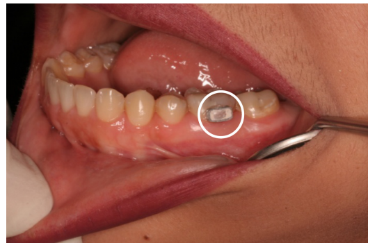
Figure 1 Photograph of the in situ appliance.

Each of the lesion-bearing tooth blocks was mounted within an intra-oral appliance, a customized orthodontic bracket (Figure 1). The appliance consisted of an orthodontic molar pad with retentive mesh backing, which had a stainless steel band welded to it so that the band closely enclosed each test enamel block. The enamel specimen was retained within the