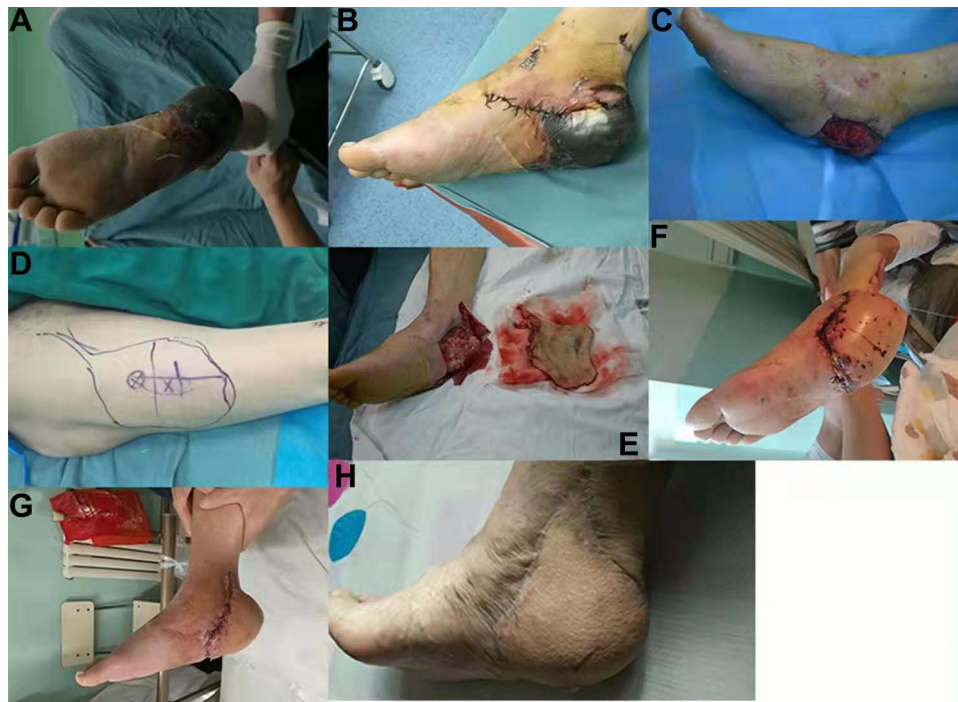
Figure 3 Avulsion injury and necrosis of skin and soft tissue of right calcaneus, repair of anterior lateral perforator flap of ipsilateral femur. (A and B) Preoperative appearance photo. (C) Wound surface after VSD coverage. (D) Ipsilateral femoral anterolateral flap design, size 12.5 cm × 18cm. (E) Split flap. (F) Postoperative appearance (1 week). (G) Postoperative appearance (3 weeks). (H) 42 months follow-up after operation, 2PD 1 mm, satisfactory function and appearance.