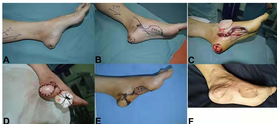
Figure 1 Excision of medial metatarsal skin mass in left heel, repair of medial plantar island flap. (A) Preoperative appearance photo, Mass size 3.0cm × 3.0cm. (B) Flap design. (C) Flap extraction, size 4.0cm × 5.0cm. (D) Flap suture. (E) Flap survival (3 weeks). (F) Followed up 44 months after operation, 2PD 5mm, no tumor recurrence, normal function.

A 30-year-old male patient was admitted to the hospital on December 25, 2016, owing to two weeks of skin necrosis after a calcaneal fracture. On the third day of admission, the “trauma expanding and vacuum sealing drainage (VSD) coverage” was conducted, and the “trauma expanding, distally pedicled sural nerve nutrient vessel flap repair” was conducted on January 4, 2017. The necrotic tissue and surrounding inflammatory granulation tissue were resected during the operation. The flap area was 3.5×6.5 cm, the pedicle length was 4.5 cm, and the lateral sural cutaneous nerve was anastomosed. The donor site was sutured directly, and the flap survived. The patient