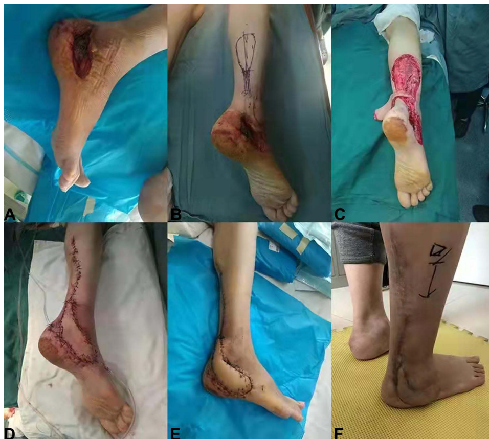
Figure 2 Bone exposure after right calcaneus fracture, distal pedicled sural nerve nutritional blood vessel flap. (A) Preoperative wound situation, exposed steel plate. (B) Flap design. (C) Flap extraction, area 3.5 cm × 6.5 cm, pedicle length 4.5 cm. (D) Covered by flap, the donor area is closed directly. (E) Primary wound healing (2 weeks). (F) 23 months after operation, 2PD 9 mm, satisfactory function and appearance.

Routine therapy was conducted postoperatively, together with symptomatic and hyperbaric oxygen therapy for patients with flap crises. Adjuvant treatment with elastic stockings and compression bandages was conducted four weeks after surgery, and silicone heel pads were worn in the case of weight-bearing.