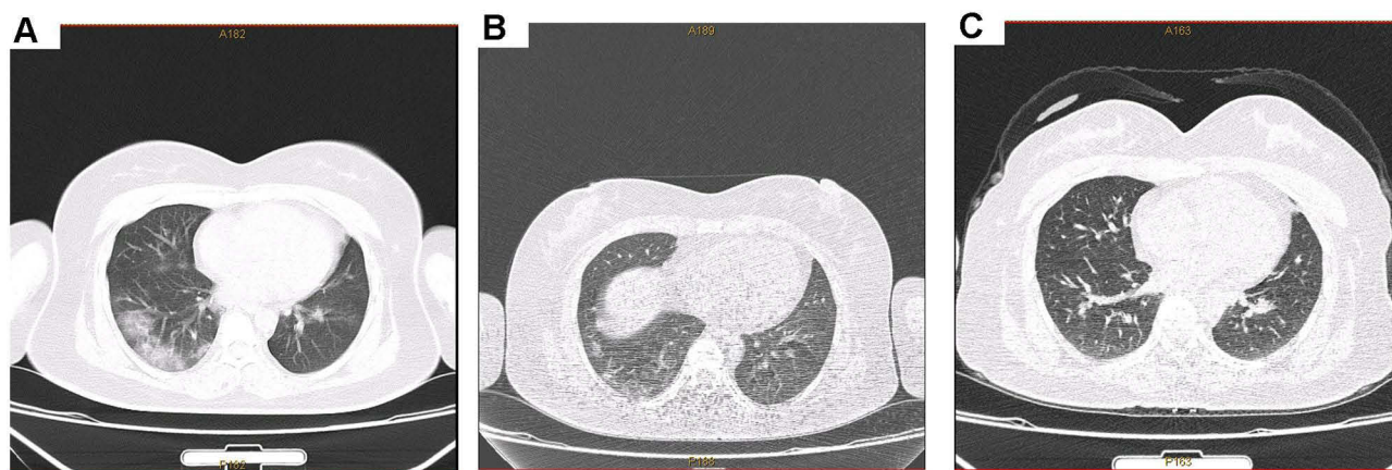
Figure 2 Computed tomography scan results of the patient's mother's lungs. (A) On January 23, 2020, computed tomography (CT) scan of the patient's mother, a 40-year-old female, showed ground glass density shadow under the pleura of both lungs and the bilateral middle and lower lungs; (B) Chest CT examination on February 6, 2020 showed that the lung lesions were obviously absorbed; (C) CT scan images on February 24, 2020 showed that most of the multiple exudative foci in both lungs were absorbed and dissipated.

Department, Hospital Infection Management Branch, etc. was consulted for the cases of the patient and his parents.