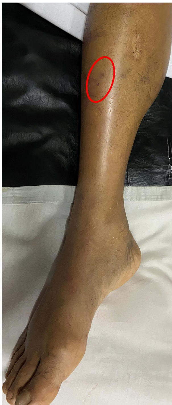
Figure 1 A swollen right leg with fang marks (fang marks were circled in red).

ceftriaxone one gram twice a day. The patient and patient's family had no history of hypertension, diabetes mellitus, or heart disease.