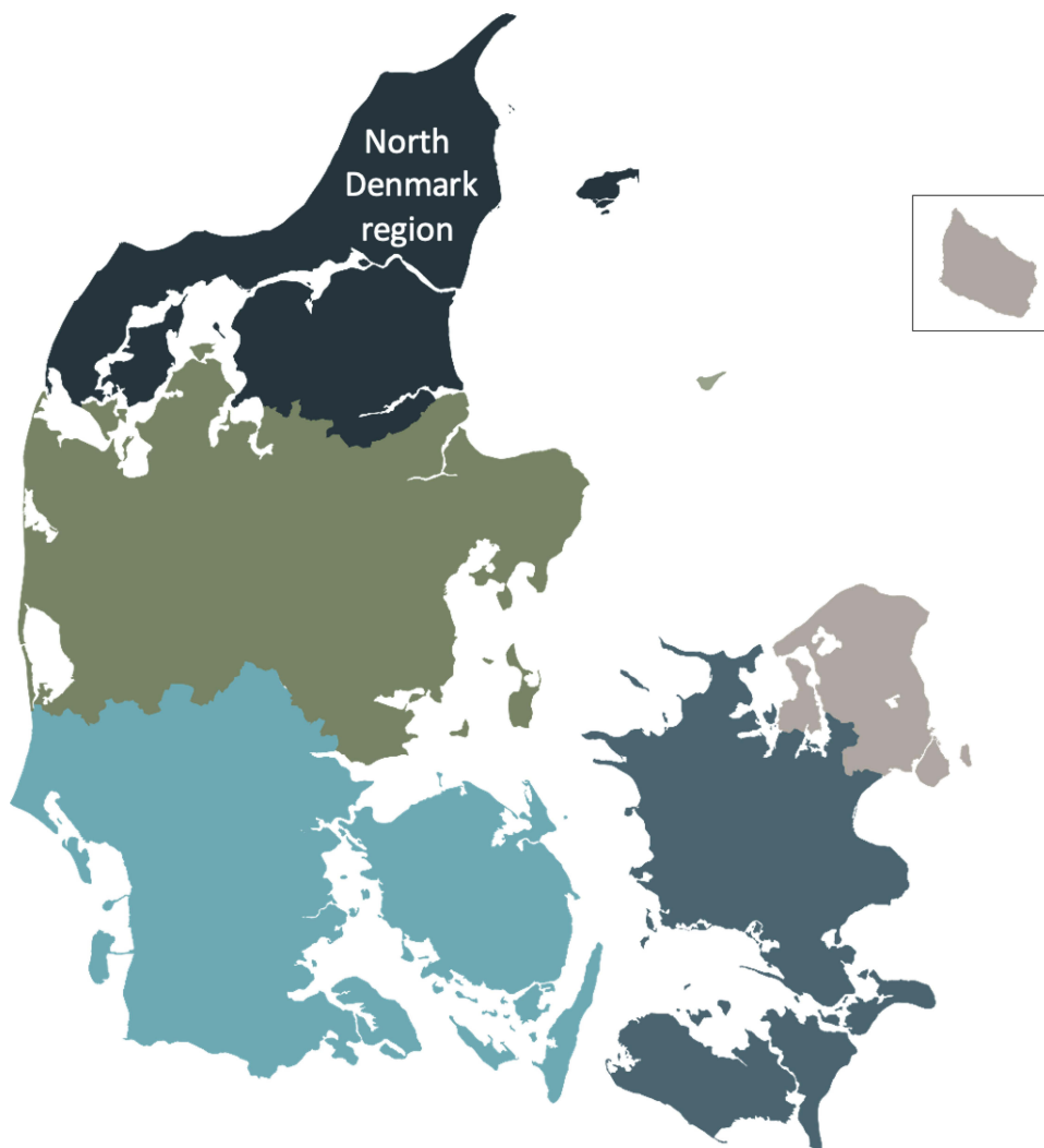
Figure 1 A map of the Denmark. The North Denmark Region is marked with black.

Medical care is tax-supported and free of charge for all residents in Denmark. A unique civil registration number is assigned at birth, which allows for a unique identification of all Danish residents and an unambiguous linkage of individuals between registries. 10 In the North Denmark Region, an outpatient clinic for patients with long-COVID was established on January 1, 2021 at Aalborg University Hospital (Figure 1). The catchment population was 590,439 (January 1, 2021) and 21,727 had tested positive for SARS-CoV-2 in the North Denmark Region during the study period. 14,15 Patients eligible for consultation at the hospital outpatient clinic were required to have had symptoms for >6 weeks and a previous SARS-CoV-2 infection documented by a positive polymerase chain reaction (PCR) test on a respiratory sample or a positive serum antibody test. In addition, all patients admitted with acute COVID-19 infection requiring oxygen treatment were invited to a follow-up examination at Aalborg University Hospital.