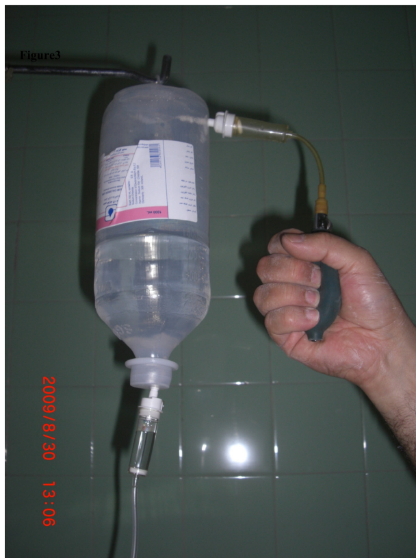
Figure 3 Hand pumping to increase pressure.

the use of our new delivery system the flow rate increased to 7.5 mL/sec at maximal hand pressure.