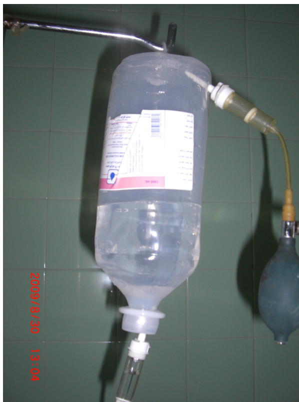
Figure 2 Pump and bulb connected to normal saline bag.

in group 1, while in group 2 this problem was seen in 93 (29.9%) of 311 cases. Clot retention episodes in group 2 decreased from 10 of 234 (4%) to 6 of 321 (1.8%) cases (Table 1). These differences were statistically significant ( P = 0.001 ). The maximum and average flow rate of the system were evaluated. The gravity-dependent flow rate of an irrigant system suspended at 80 cm is 3 mL/sec, whereas with