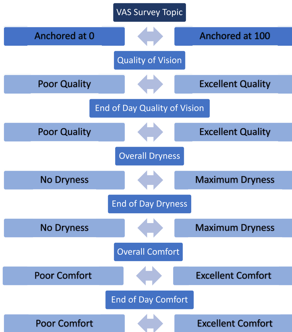
Figure 3 End of study visual analog scale (VAS) surveys presented and text describing each anchor, as presented to participants.

Contact lens related dryness was evaluated through with VAS surveys and the CLDEQ-8. Median (interquartile range) overall dryness was 28.50(49.00) and end of day dryness while wearing the contact lens was 30.50(64.25). CLDEQ-8 scores revealed a median (interquartile range) of 9.50(11.75).