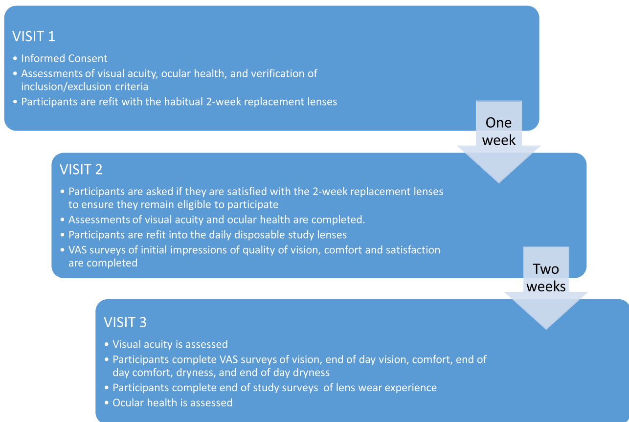
Figure 1 Study design.

completed entering LogMAR visual acuity testing using a standardized ETDRS visual acuity chart on a light box positioned at 4 meters. Participants then removed their contact lenses for an anterior segment ocular health evaluation using biomicroscopy. If inclusion and exclusion criteria were met, the participant was refit with a new pair of their habitual planned replacement lenses to assure the lens fit and prescription was optimized before the refitting at Visit 2. Participants were instructed to continue their current cleaning and care regimen, reminded not to sleep while wearing the lenses, and were scheduled for a second study visit in one week.