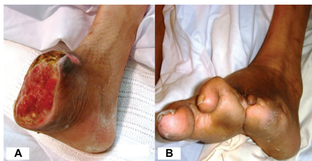
Figure 3 Case 2, right foot stump with good granulation tissue 10 days post bypass A ). The left foot with previous toes amputation B ).

and he started ambulating with custom-made shoes. He was discharged 4 weeks after the bypass procedure.