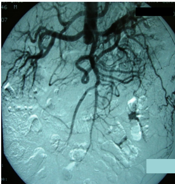
Figure 1 Angiogram of the case 1 patient showing complete occlusion of infrarenal aorta.

The patient was a 63-year-old man who was hypertensive and a diabetic on insulin. He had coronary artery disease that had been treated with multiple cardiac catheterizations and stenting and had severe bilateral peripheral artery disease. He was being conservatively treated for bilateral carotid artery stenosis. A year earlier, he presented with bilateral lower limb ischemia and left foot toes infection. Angiogram showed severe aortoiliac occlusive disease. He had bilateral common iliac angioplasty and stenting, followed by amputation of his infected toes. His left foot healed completely. On this admission, he presented with sepsis that had resulted from wet gangrene of his right forefoot. He had absent femoral and distal pulses with bilateral ABIs of 0.3. After an emergency metatarsal amputation under ankle block, he was transferred