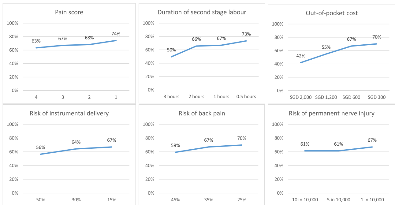
Figure 4 Predicted demand of epidural analgesia based on changes in epidural outcomes.

epidural remained around 61% to 67% when the risk of permanent nerve injury ranged from 0.01% to 0.10%. The predicted demand ranged from 42% to 70% for SGD2000 to SGD300 out-of-pocket cost.