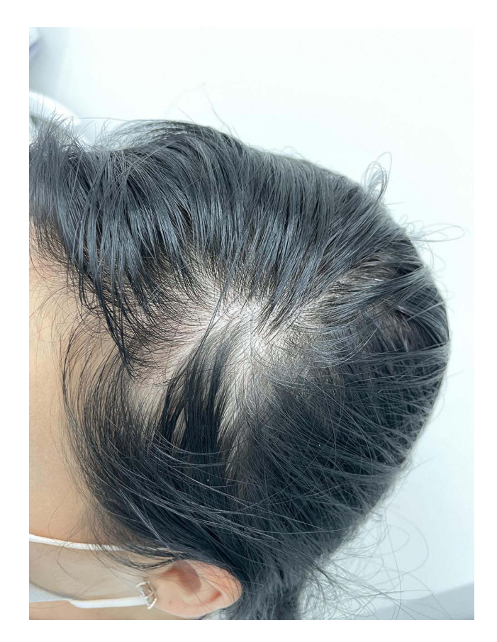
Figure 2 Acute reduction in total hair density in a 37-year-old female who is recovering from moderate SARS-CoV-2 infection. The diffuse hair loss is most noticeable in the frontotemporal region and first developed within two months after COVID-19. The patient also reported high levels of anxiety caused by the acute hair loss.

Most patients are anxious that they will gradually lose all the hair on the scalp, and is important to clarify that this is not expected since the shedding is known to affect up to 30% of scalp hair.<sup>17</sup> It is also necessary to reassure the patient that fortunately, the disorder is reversible. The hair loss is usually self-limiting and spontaneous improvement is expected after 6 to 12 months from the onset of the condition to noticeable improvement.<sup>18</sup>