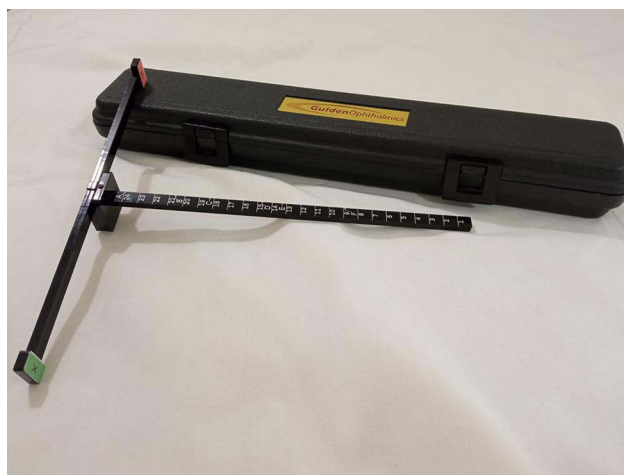
Figure 1 OculoMotor Assessment Tool (OMAT).

This T-shaped tool is non-invasive and can be used chair-side. The OMAT (Figure 1) has two 25-cm long bars, attached to form a T-shape with magnets that can be rotated and locked. The OMAT is comprised of high-contrast white-on-black targets, as well as red and green "X" targets.