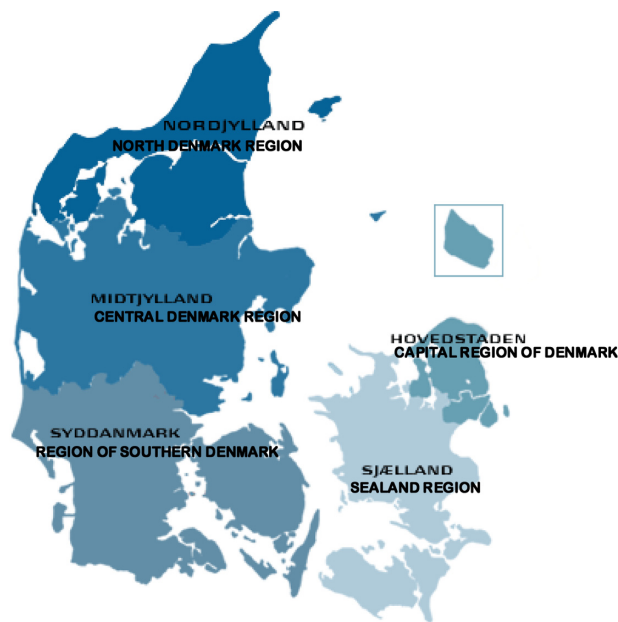
Figure 1. The five regions of Denmark formed by the 2007 municipal reform (source: www.fm.dk ). 4

Note: *English names are given according to Danish Regions. 5