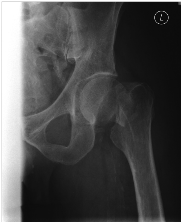
Figure 2 Displaced fracture neck of femur in an independently mobile 78 year old.

reported a dislocation rate of 32% in mentally impaired elderly patients compared with 12% in lucid patients. 39