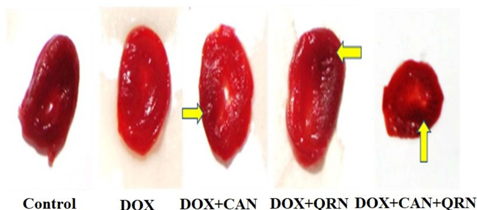
Figure 1 Effect of CAN, QRN, and CAN+ QRN on morphometry of cardiac tissue. Yellow arrows depict brick red coloration indicative of a greater number of viable cells in treatment groups.

Doxorubicin (DOX) is one of the main anticancer drugs that can induce oxidative damage to cardiac tissues. It mainly targets the cardiac antioxidant defence mechanism. In recent times, many endogenous myocardial antioxidants have become promising therapeutic targets of treatment associated with increased oxidative stress. 37 Doxorubicin causes rats