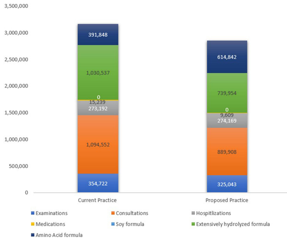
Figure 2 Cost breakdown of AAF use in current and proposed practice in Kuwait. Abbreviations: AAF, Amino acid formula; KWD, Kuwaiti Dinar.