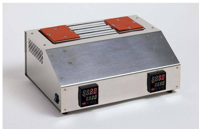
Figure 1 Image of the thermal grill device.

The thermal grill was designed and manufactured by Anatz (Seoul, Republic of Korea) according to previous validated studies (Figure 1). 21–23 The device used for generating the TGI consists of two parts: a control unit and thermal bars. The temperatures of the cold and hot bars were controlled and recorded using a digital thermometer. The temperature of each bar was generated by Peltier elements and finely controlled by the settings of the control unit. The temperature of the cold bar was set to 20\pm 2 °C and that of the hot bar was set to 40\pm 2 °C. A grill consisting of six 12-mm wide and 120-mm long