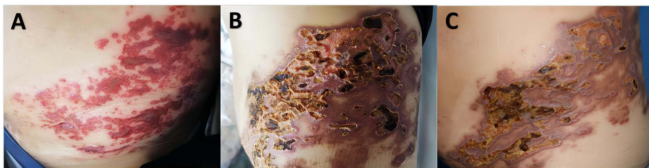
Figure 1 Clinical pictures of the patient with gangrenous herpes zoster complicated with candida infection. (A) Image of the lesions 4 days after onset. (B) Image of the lesions before antifungal therapy. (C) Image of the patient after 1 week of antifungal therapy.