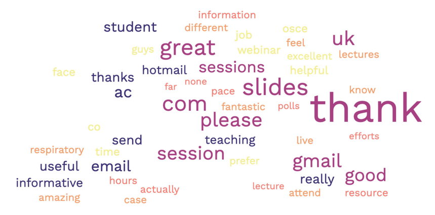
Figure 2 Wordcloud comprising most common comments made by the participants.

cloud generator tool. A related-samples Wilcoxon signed rank test was used to determine differences in proportions between groups. A p-value threshold of <0.05 was considered significant.