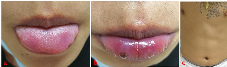
Figure 2 (a) The erosion surfaces of the patient's lips became softer, smaller and flatter obviously. (b) The erosion surfaces of the patient's tongue became softer, smaller and flatter obviously. (c) The erythema of the trunk completely subsided.

(Figure 1b). The patient had fuzzy infiltrating erythema in the front and back of the trunk, which was symmetrical distribution, about the size of soybeans (Figure 1c). A mung-bean sized erythema could be seen on the right side of the glans coronal sulcus, which was slightly hard to touch.