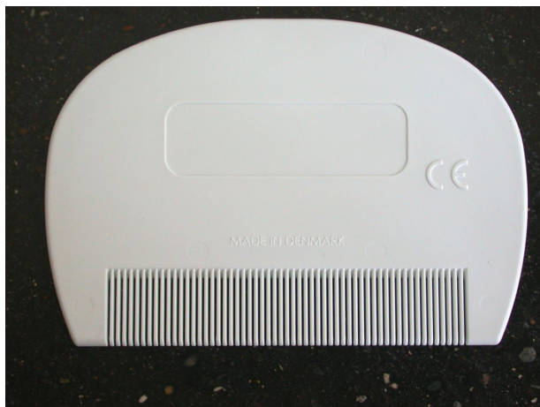
Figure 1 The 'PDC' head louse detection comb.

All prospective participants signed consent forms before being screened for the presence of at least five live head lice, found within a maximum screening time of 5 minutes, by using a plastic detection comb (KSL Consulting, Helsingør, Denmark, Figure 1). Each infested household member could