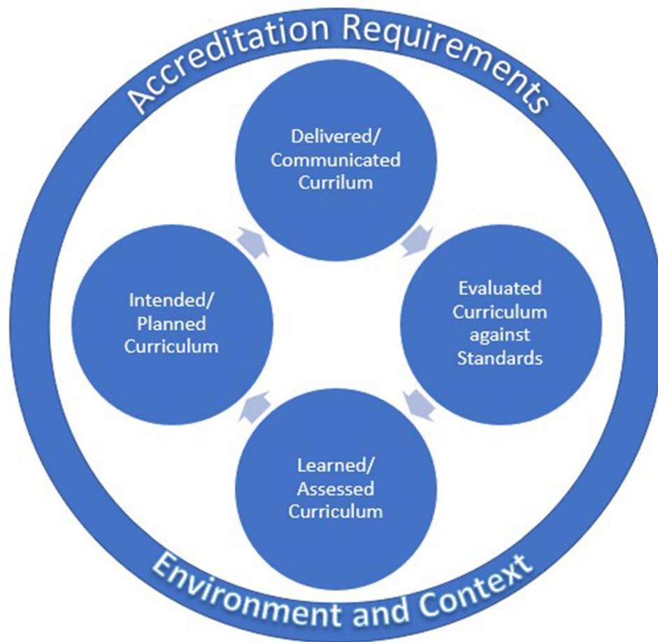
Figure 1 Conceptual Framework for Curriculum Mapping.