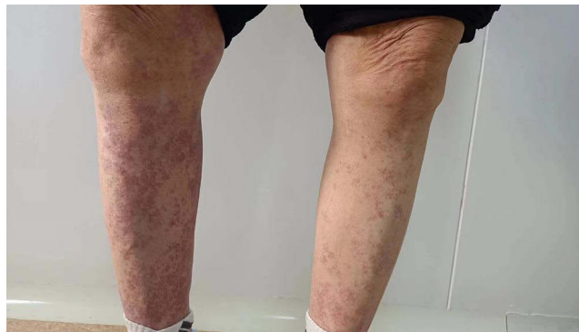
Figure 2 Gross photographs of the patient's lesions on both lower limbs.