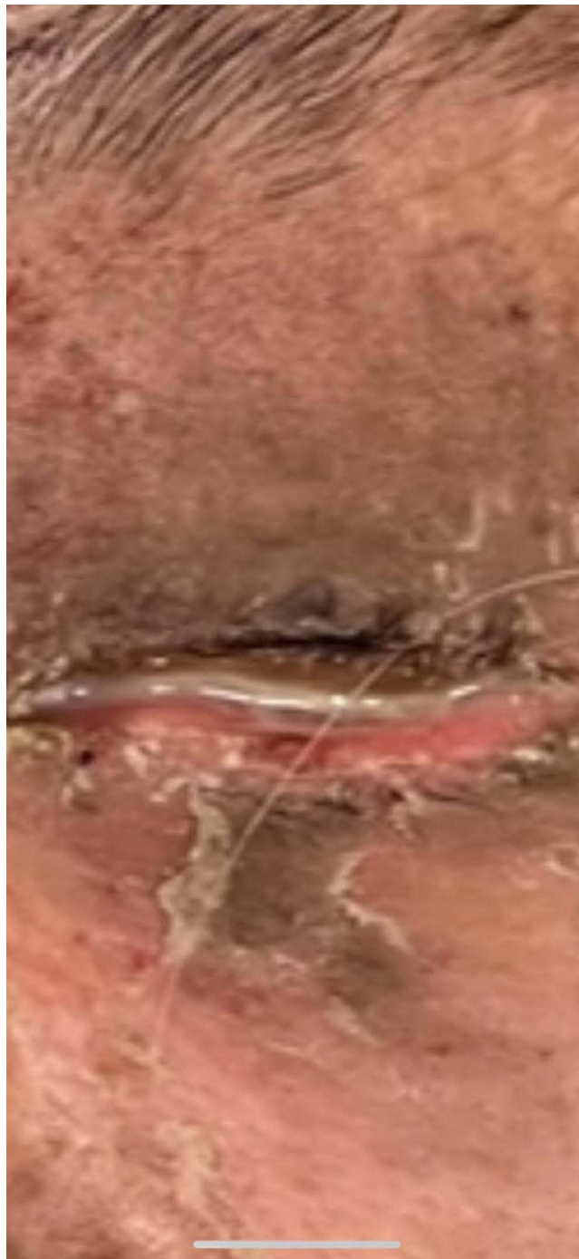
Figure 3 Sloughed mucosa on the lashes and around the eyelids with drainage.

We describe a case of a 95-year-old Asian female who developed a delayed hypersensitivity reaction to allopurinol after 10 days from initiating therapy. This is similar to the case presented by Wang et al as their patient developed cutaneous symptoms after 10 days from starting allopurinol. 8