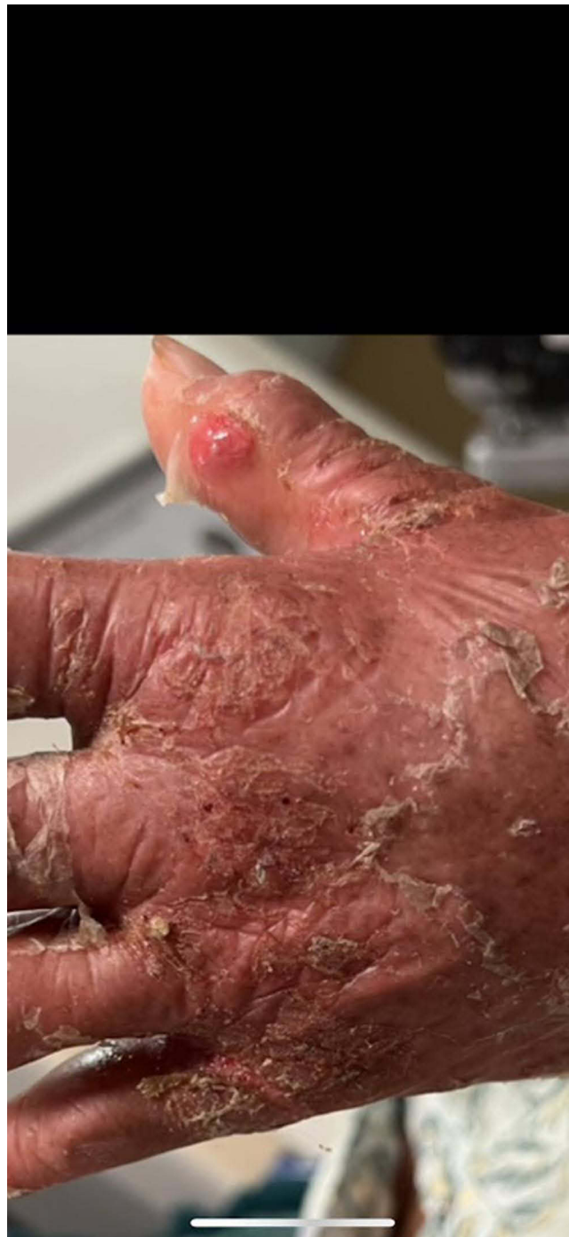
Figure 2 Detached skin around the hands area.