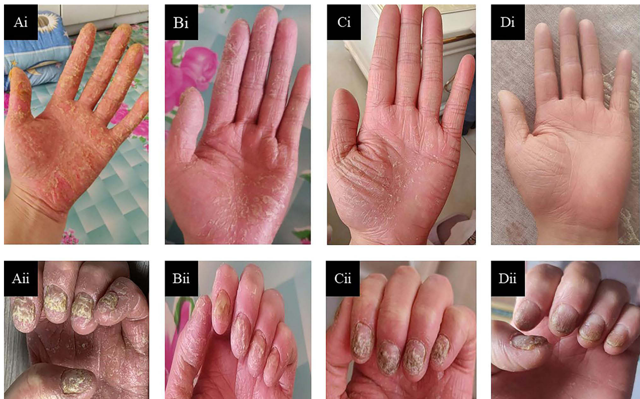
Figure 2 Presentation of severe erythematous keratotic lesions and pustules on the palms ( Ai ) and yellowing of nails ( Aii ), suggestive of palmoplantar pustulosis. Improvement of palms ( Bi ) and nails ( Bii ) after treatment with secukinumab. The palmoplantar pustules were alleviated after 3 months ( Ci , Cii ) and 8 months ( Di , Dii ) of discontinuing secukinumab and receiving treatment with tofacitinib.