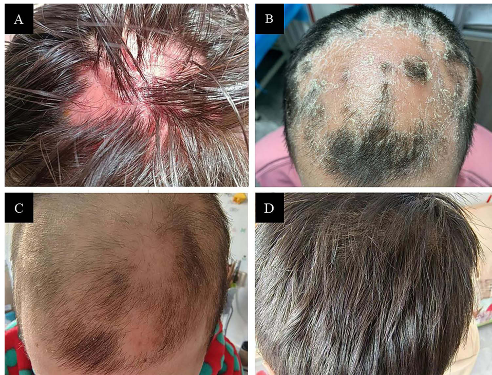
Figure 1 (A) Hair loss observed after starting therapy with secukinumab. (B) Alopecia areata was evident after completing the induction period (5 weeks) of secukinumab. Gradual improvement of Alopecia areata after 3 months (C) and 8 months (D) of secukinumab discontinuation and treatment with tofacitinib.

warrant discontinuation of secukinumab. By the completion of the induction period, at week 5, the hair loss worsened and the patient developed significant AA (Figure 1B), characterized by a scaly rash on the scalp and distinct borders of hair loss. There were no apparent emotional stressors, history of diseases (atopic dermatitis, vitiligo, or thyroid disease) associated with AA, or significant blood test changes. Considering the timing of AA onset in relation to the biological therapy, secukinumab was considered a possible causative factor and subsequently discontinued. The patient then initiated monotherapy with tofacitinib (5mg po bi-diurnally). After three months of treatment, gradual improvement in AA was observed (Figure 1C). By the eighth month, significant alleviation of AA lesions was evident (Figure 1D). Additionally, the patient's palm pustules (Figure 2Ai) and nail damage (Figure 2Aii) associated with PPP showed improvement following completion of the induction period of secukinumab (Figure 2Bi and Bii). Notably, significant alleviation of PPP symptoms was observed based on clinical photographs after 3 months (Figure 2Ci and Cii) and 8 months (Figure 2Di and Dii) of discontinuing secukinumab and initiating treatment with tofacitinib. The patient continues to be followed up.