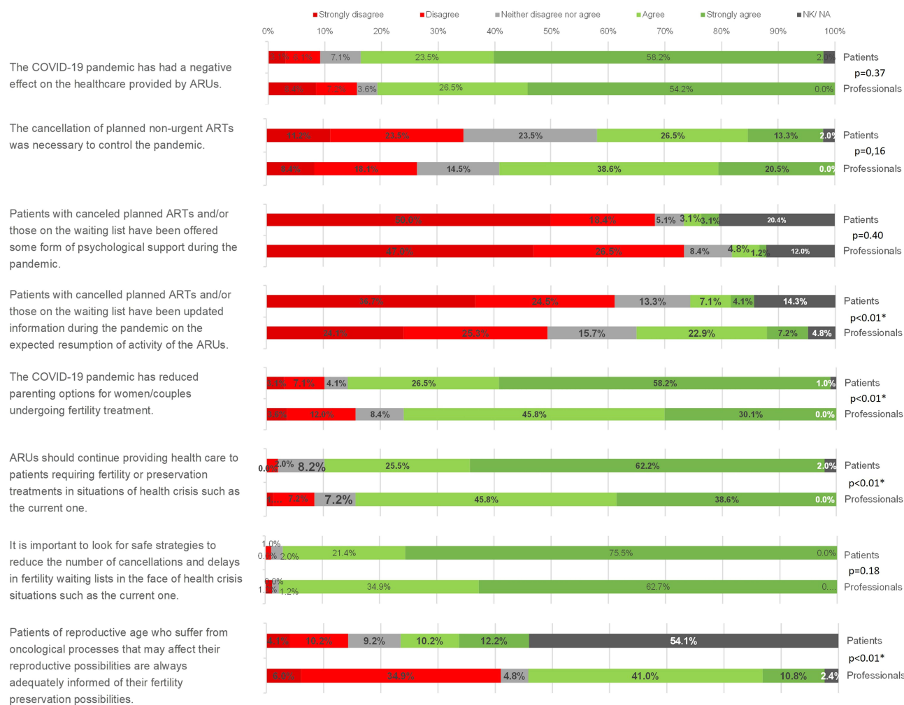
Figure 3 Answers to ad-hoc questionnaire by patients and professionals in arus on the impact of the pandemic on art service management (*p-value<0.05).