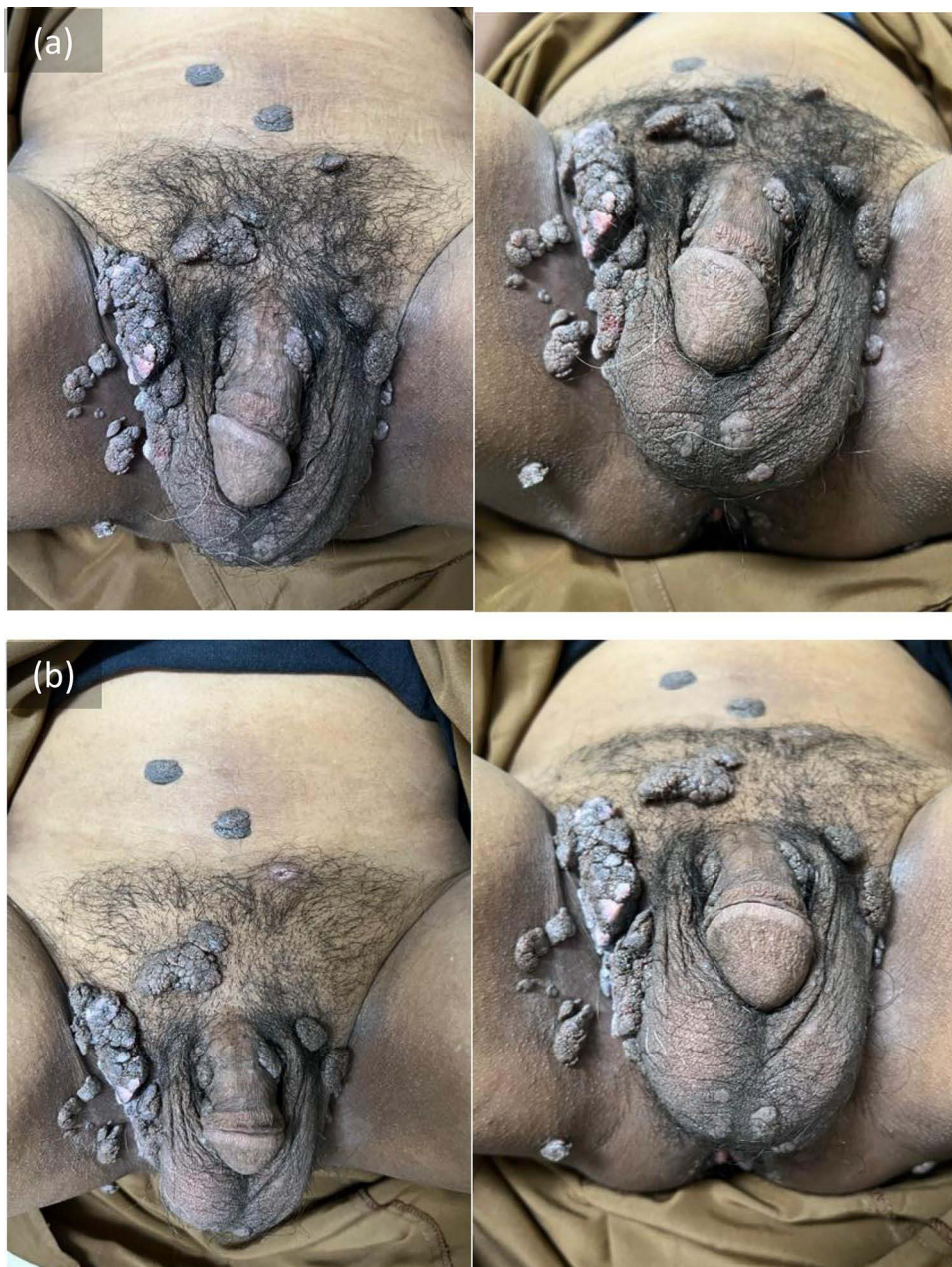
Figure 1 Continued.

AGWs are the most frequent STIs found worldwide. 15 Based on a previous review conducted between January 2001–2012, the regional distribution of new cases per 1000,00 population was as follows: 101 to 205 in North America, 118 to 170 in Europe, and 204 in Asia. 7 A previous study found a significant association between a history of circumcision, often related to religious belief, and a lower incidence of AGWs. 11 This condition is also considered a risk factor for penile cancer. 3 More than 30 types of HPV are known to infect genital tract. Based on the potential of the infected cells to progress into malignancy, HPV has been divided into high- and low-risk types. 16 The high-risk HPV, including types 16, 18, 26, 31, 33, 35, 39, and 45 cause malignant lesions such as carcinoma of the cervix, vulva, vagina, anus, or penis. Meanwhile, low-risk types 6, 11, 40, 42, 44, and 54 are associated with benign lesions, such as AGWs. 17 The clinical manifestations of HPV infections are somewhat correlated with epithelial tropism of different types. 6