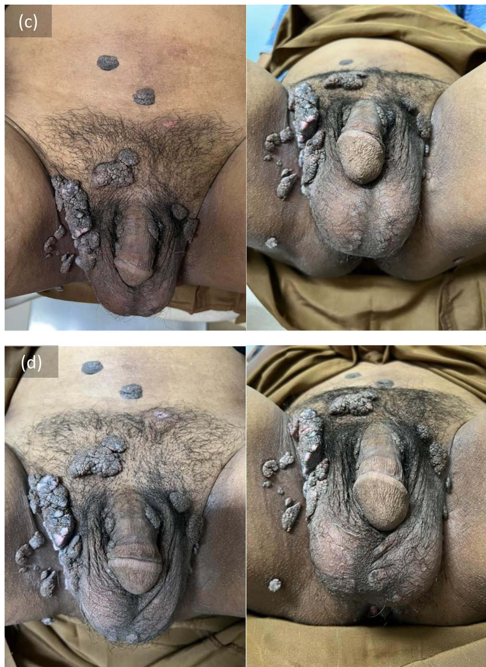
Figure 1 (a–d) Clinical manifestation before treatment (a); after first injection (b); second injection (c); and third injection (d).

The transmission of HPV mainly occurs through sexual routes, including genital, anal, or oral. 6 During intimate contact, the basal keratinocytes, as the primary targets of HPV, are exposed through minor abrasions, providing access to infection. 18 The rate of transmission between sexual partners is high and may occur without visible warts. 1 Maceration promotes infection, and it frequently results in autoinoculation to the nearby skin. 18 Autoinoculation may also cause the spread of lesions to extragenital areas through contaminated objects, such as toiletries, razors, or towels. 9 However, the occurrence of extragenital CA, in the axilla, 9 inframammary, 19 abdomen, 20 and pannus 21 without associated genital infection, has been previously reported. An immunocompromised state can serve as a favorable environment for HPV infection with subsequent epidermal transformation. In cases of CA in extragenital areas, it is crucial to investigate the patient immunological status. 9 In immunocompromised patients, AGWs can appear more extensive, multifocal, and less