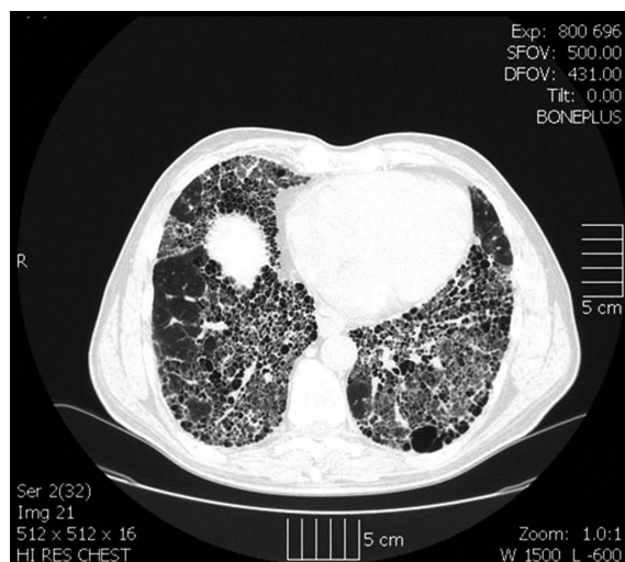
Figure 1 High resolution computed tomographic (HRCT) scan shows advanced idiopathic pulmonary fibrosis in a patient who eventually required lung transplantation. The scan demonstrates interlobular thickening, traction bronchiectasis and advanced honeycomb formation at the peripheral lung bases.

Corticosteroids were one of the earliest treatments used for IPF, because lung fibrosis was seen as final result of long-term inflammation. 16–19 Misclassification of lung diseases occurring in corticosteroid-responsive conditions, such as collagen-vascular diseases, reinforced the use of corticosteroids in these