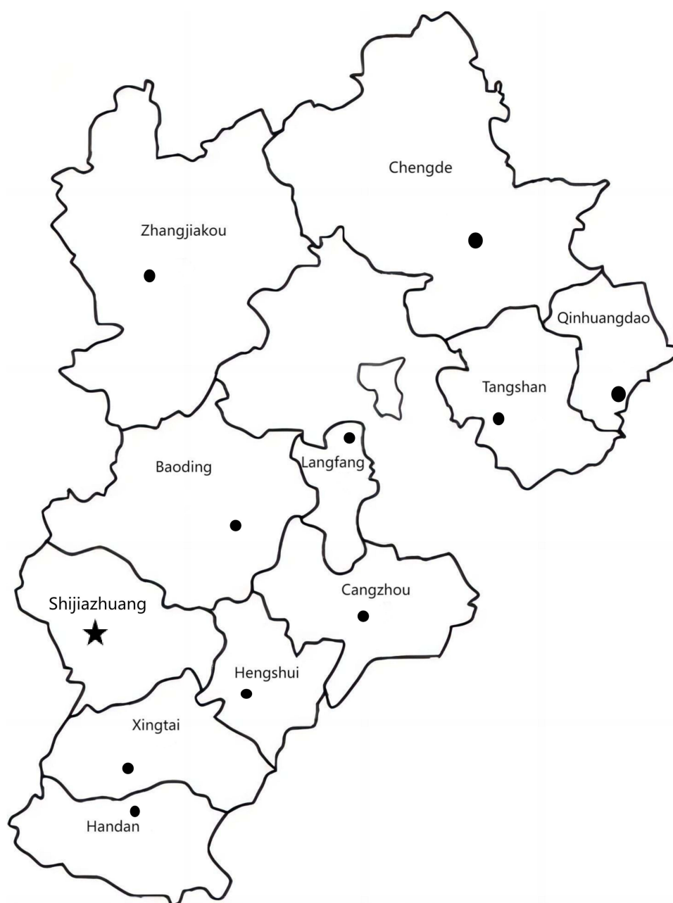
Figure 1 Hebei province map.

Notes: ★: Provincial administrative centre; Hebei Provincial Center for Clinical Laboratories location. ●: Municipal administrative center.